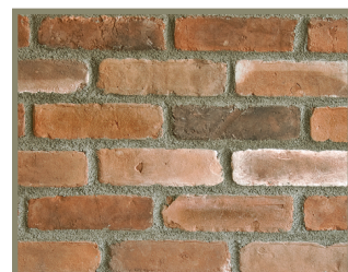
Old Montreal-Artek Brick AB-114