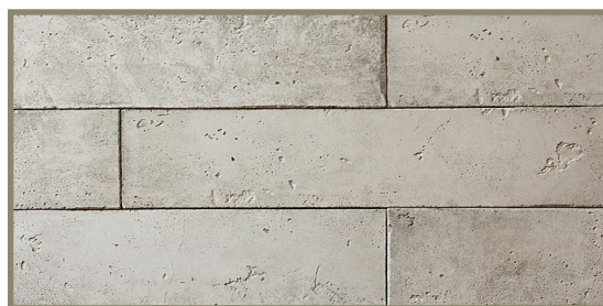
Concrete Board CB-1902

Dimensions: longueur 32", largeur 8", épaisseur 3/4"