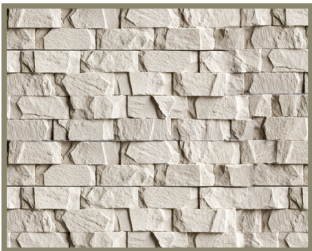
Montblanc LedgeStone AS-708