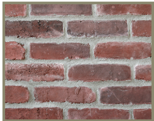
Old Montreal-Artek Brick AB-113