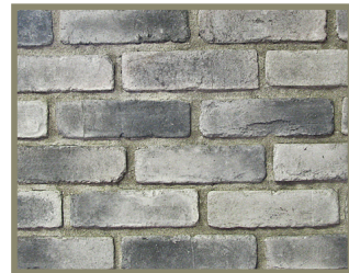
Old Montreal-Artek Brick AB-110