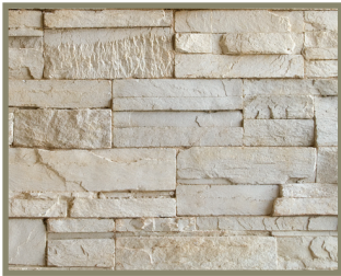
North-Ural LedgeStone AS-412