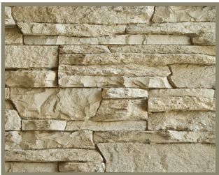
Nevada LedgeStone AS-210