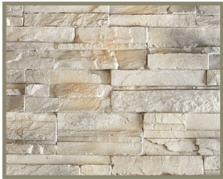
North-Ural LedgeStone AS-416