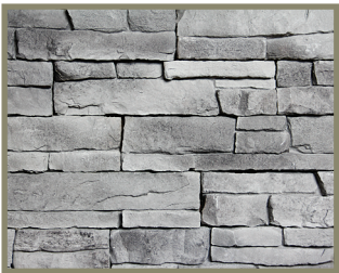
Colorado LedgeStone AS-1815