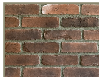
Old Montreal-Artek Brick AB-115