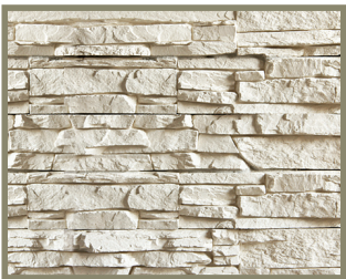
Whistler LedgeStone AS-2000