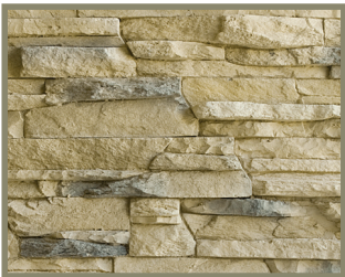
Nevada LedgeStone AS-201