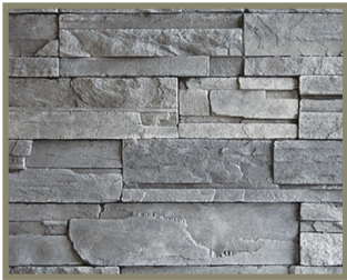
North-Ural LedgeStone AS-415