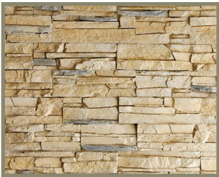
Whistler LedgeStone AS-2011