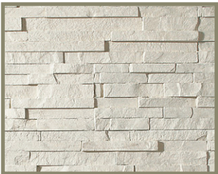
Alberta LedgeStone AS-1601