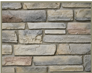
Aspen LedgeStone AS-1703