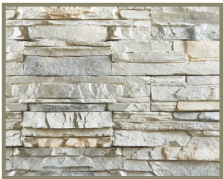
Whistler LedgeStone AS-2020