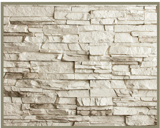
Whistler LedgeStone AS-2008