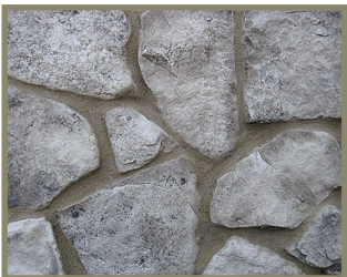
Country Fieldstone AS-803