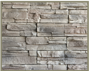
Whistler LedgeStone AS-PL