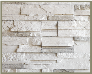
North-Ural LedgeStone AS-408