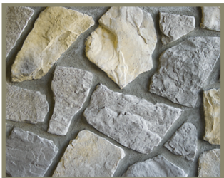
Country Fieldstone AS-802