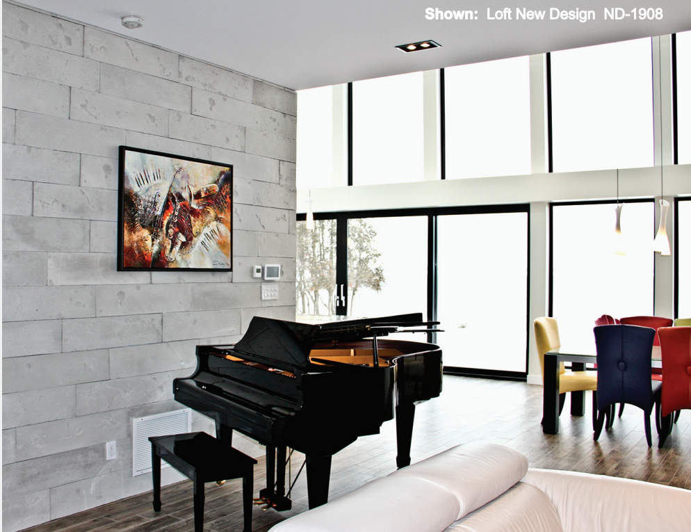
Shown: Loft New Design ND-1908

ARTEK STONE products are ideal for both indoor and outdoor decoration projects, for walls, colons, arcs, fireplaces and much more. They will satisfy even the most complex design projects.