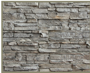
Whistler LedgeStone AS-2040