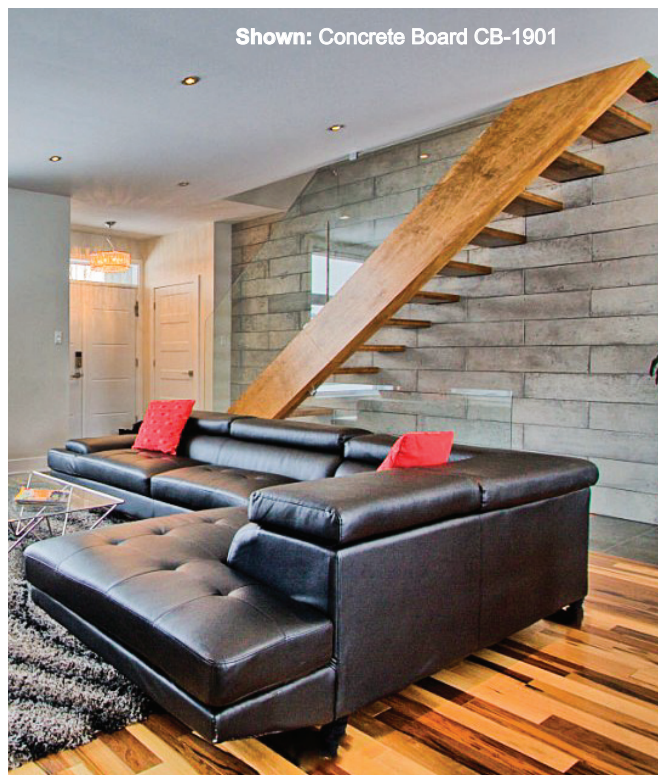
Shown: Concrete Board CB-1901