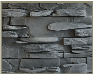
Alpina LedgeStone AS-301