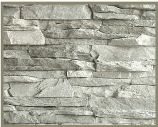
Nevada LedgeStone AS-205