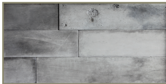
Loft New Design ND-1950

Dimensions: longueur 32", largeur 8", épaisseur 3/4"