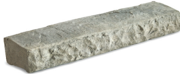
Watertable / Sill Shown: Color WS-1501

Our hearth slabs are ideal for fireplace surrounds and wood stove bases.