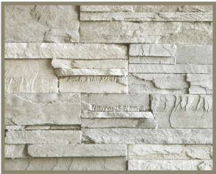
North-Ural LedgeStone AS-404

ARTEK STONE has chosen a combination of diverse textures and colors to be perfectly compatible with other materials; be it wood, glass, metal, brick or stone. The wide variety of our products will allow you to create the perfect atmosphere for interior decoration, a traditional or contemporary look for your home, a landscape arrangement or a commercial application.