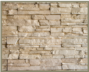
Whistler LedgeStone AS-2010