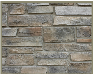
Aspen LedgeStone AS-1702