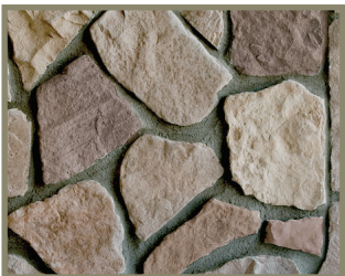
Country Fieldstone AS-801