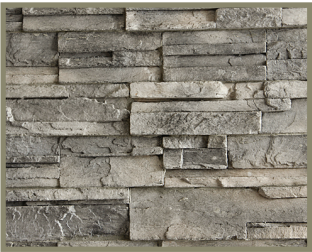
North-Ural LedgeStone AS-423