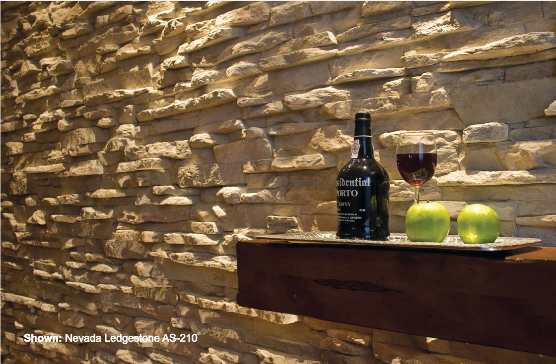
Shown: Nevada LedgeStone AS-210

Inspired by the volcanic origin of ancient rocks, the Canadian company ARTEK STONE has developed a revolutionary technology capable of replicating the beauty, the exact colors, textures and visual details of natural rocks.