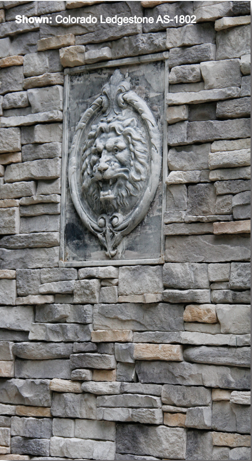
Shown: Colorado LedgeStone AS-1802

ARTEK STONE products are ideal for both indoor and outdoor decoration projects, for walls, colons, arcs, fireplaces and much more. They will satisfy even the most complex design projects.