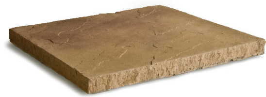
Hearthstone Shown: Color HS-1203