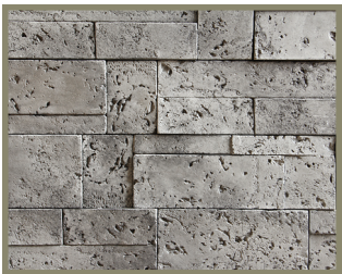
Coral Stone AS-315