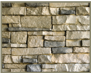
Colorado LedgeStone AS-1801