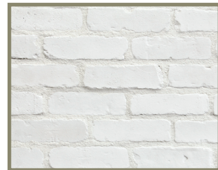
Old Montreal-Artek Brick AB-Arctic

ARTEK STONE products come in a rich variety of colors. Since multiple combinations of tones are possible, anything your imagination desires can be done