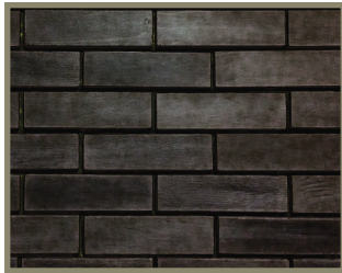
ZEN - Artek Brick AB-117