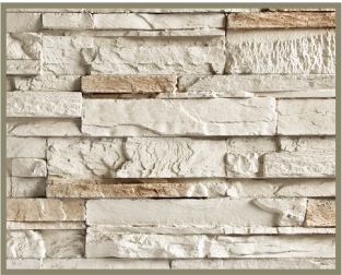
North-Ural LedgeStone AS-409-1