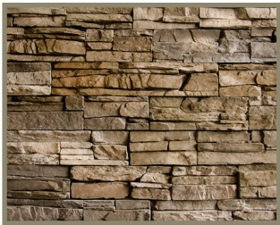
Whistler LedgeStone AS-2030