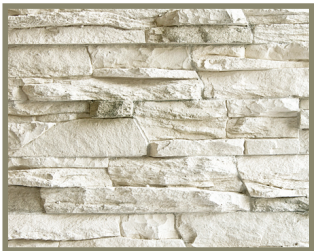
Nevada LedgeStone AS-208