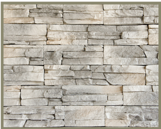
Whistler LedgeStone AS-2042