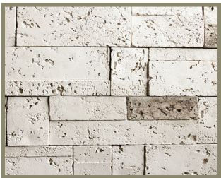
Coral Stone AS-308