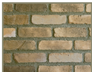
Old Montreal-Artek Brick AB-116