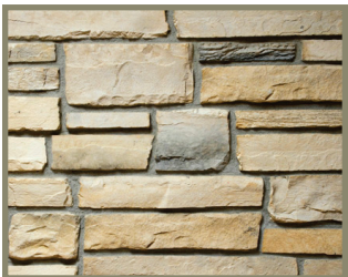
Aspen LedgeStone AS-1701