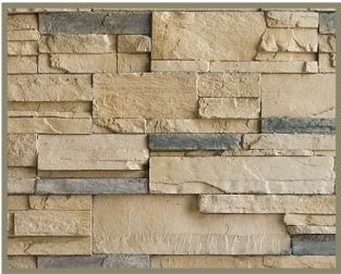
North-Ural LedgeStone AS-411