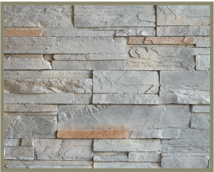
North-Ural LedgeStone AS-422