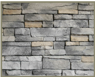
Colorado LedgeStone AS-1802