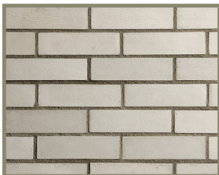
ZEN - Artek Brick AB-118