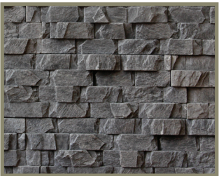
Montblanc LedgeStone AS-715