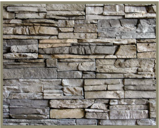
Whistler LedgeStone AS-2041