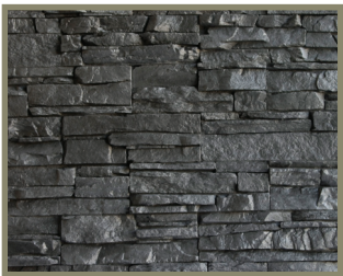
Whistler LedgeStone AS-2015